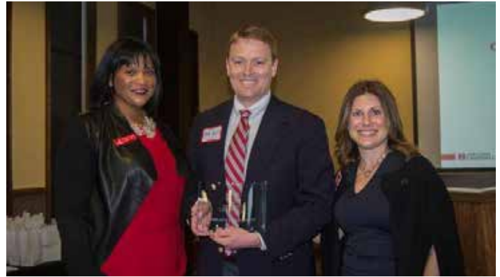
Community Partner Award: Commonwealth Bank & Trust Company