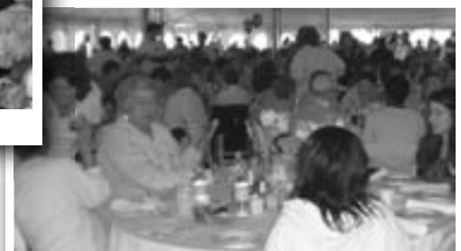
Survivors enjoy dinner hosted by Buckhead Mountain Grill and Rocky's Italian Grill.

The theme of this year's event was "Pajama Party". The women (and men) were decked out in their comfiest or craziest nighttime wear and the event included a contest for best pajamas! Other entertainment included a fashion show and some spectacular singing.