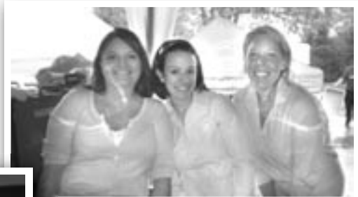
Leaguers volunteer at the 8th Annual Komen Survivors' Dinner.